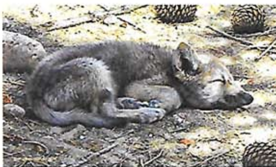
"Down For The Count"