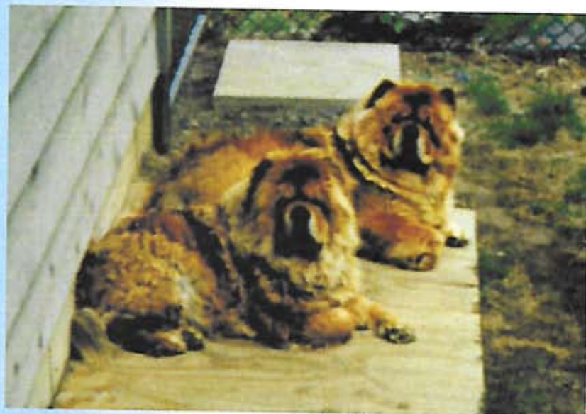
Ayrhill Anastasia T.T. and Ch. Ayrhill Ally Chin (1991)

Now 13 ½ and still enjoying life (although more slowly than in past years), Ally and sister Daisy join me in extending Best Wishes to all the exhibitors and spectators at the Chow Chow Fanciers of Canada National Specialty in Edmonton.